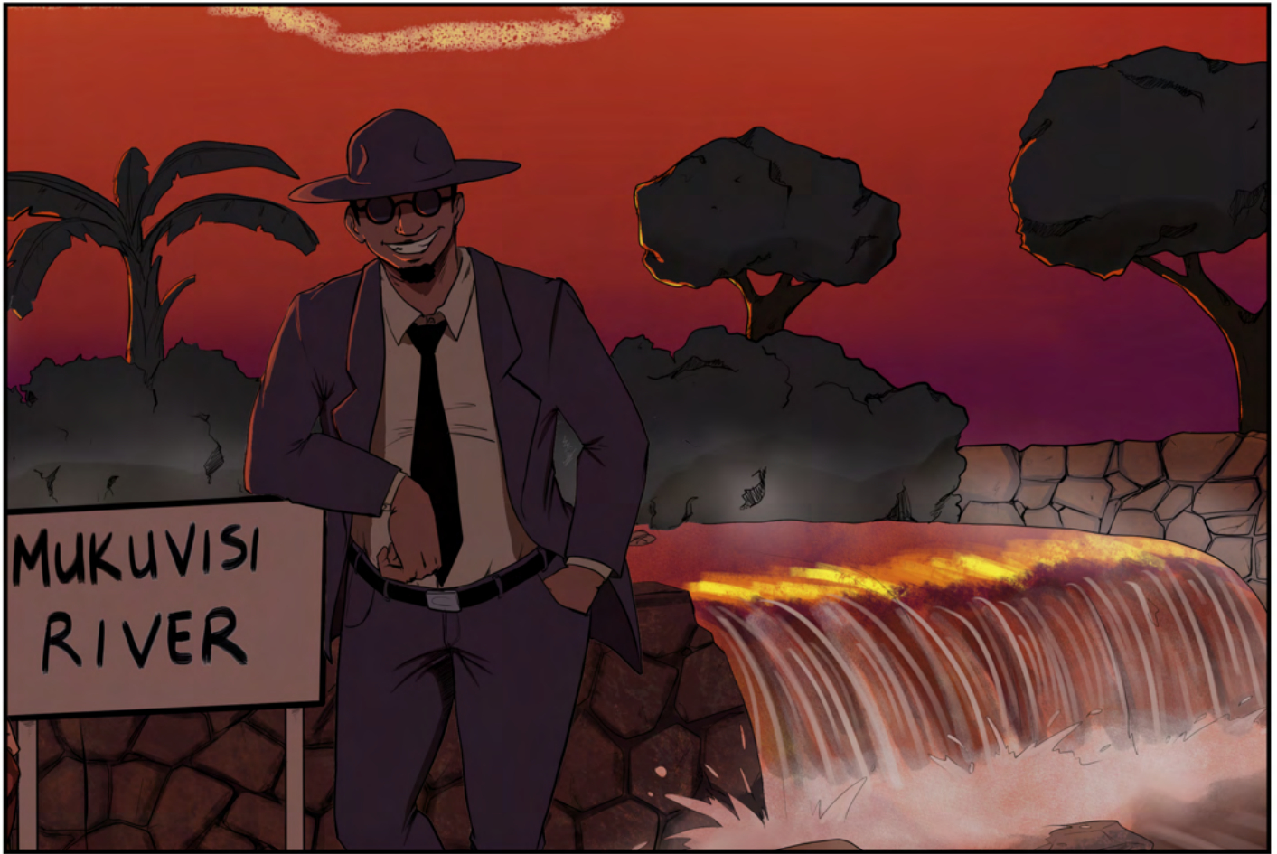
He could be collecting his water from the polluted Mukuvisi river by night.