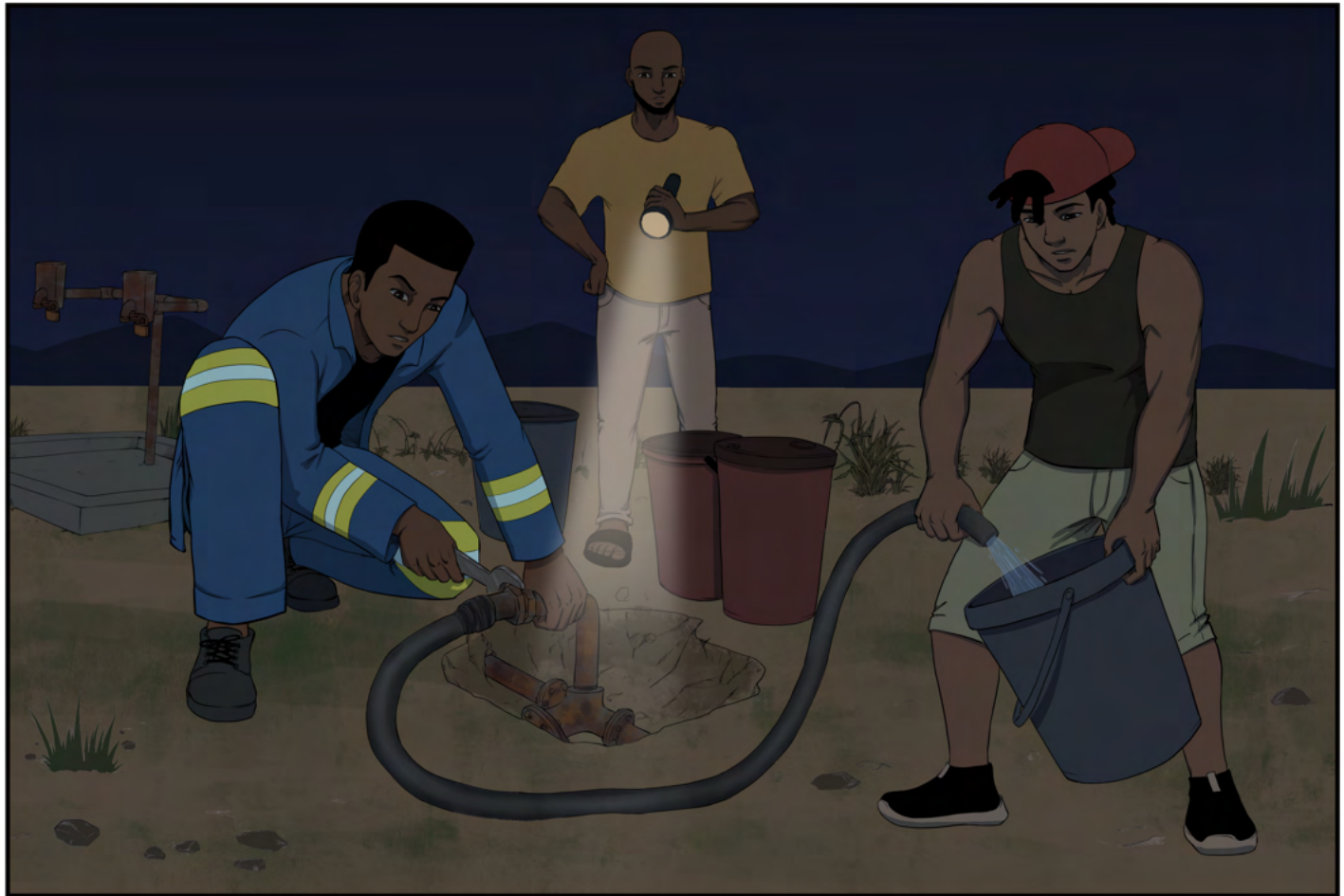
Making illegal connections to the communal water taps. The billing system began to fall apart.