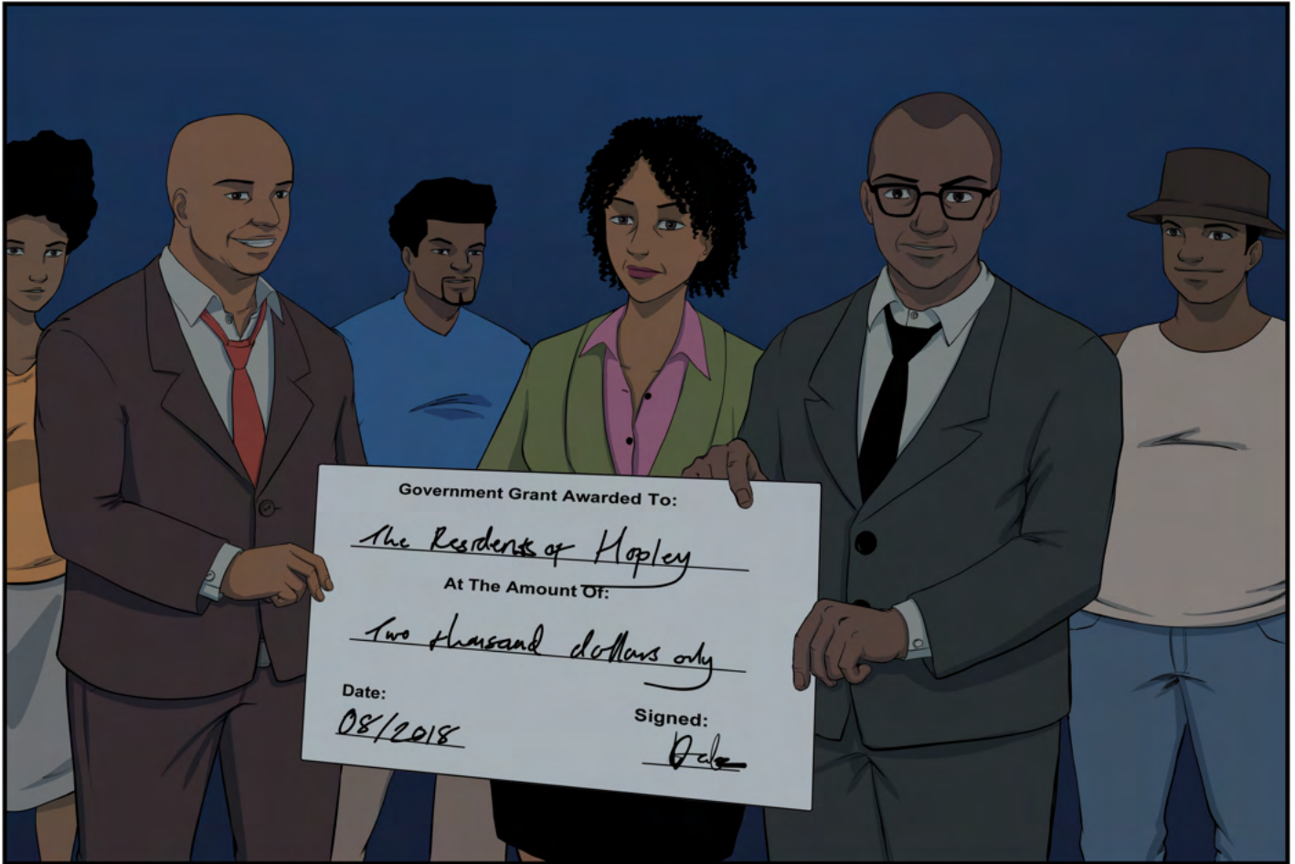
If the government supported Hopley with water grants, providing materials and mobilising communities for a labour based approach,