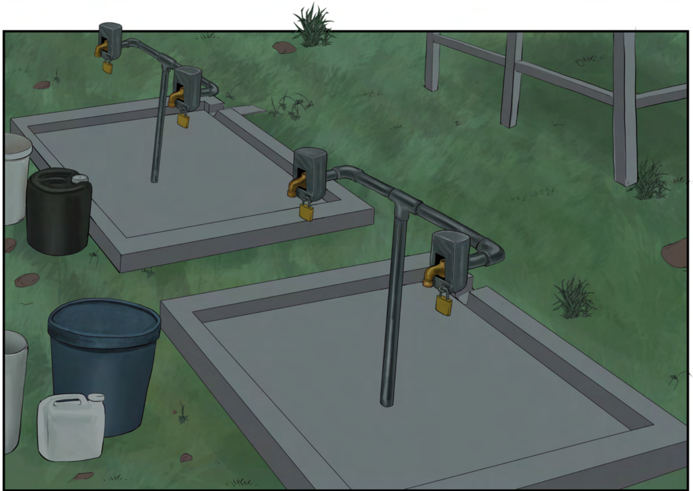
Initially, the city of Harare connected five communal water taps.