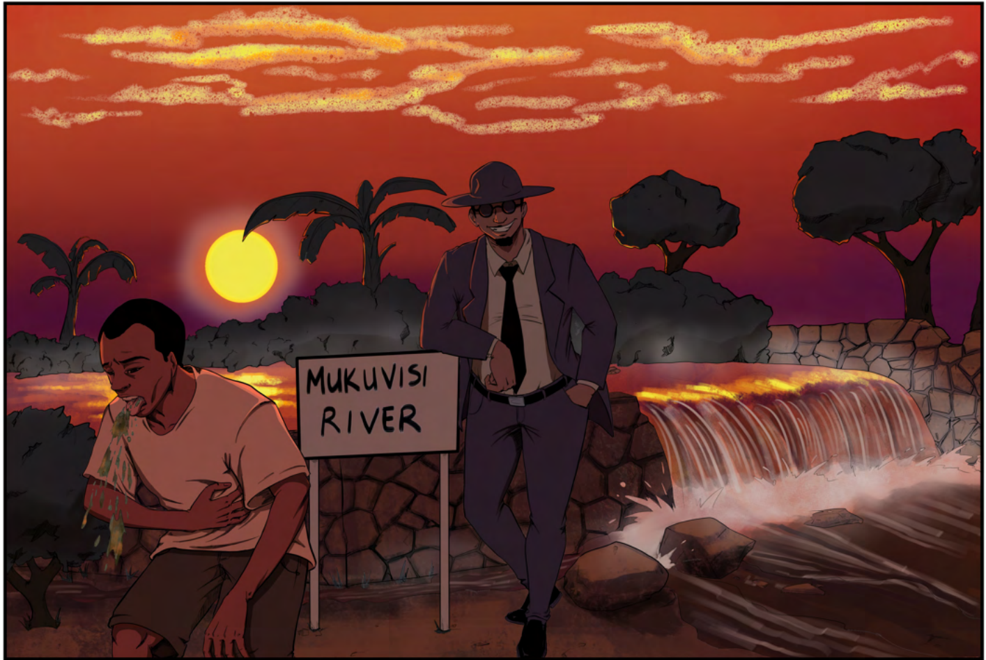
Spreading cholera, typhoid or bilharzia by day.