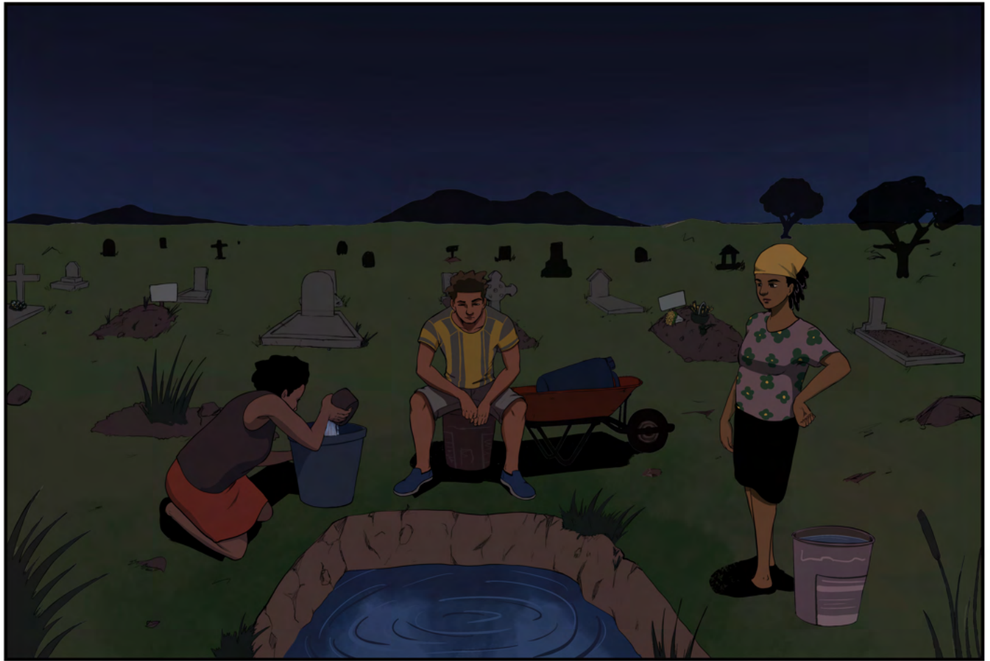
The truly desperate end up in Granville cemetery, collecting water from near the graves.