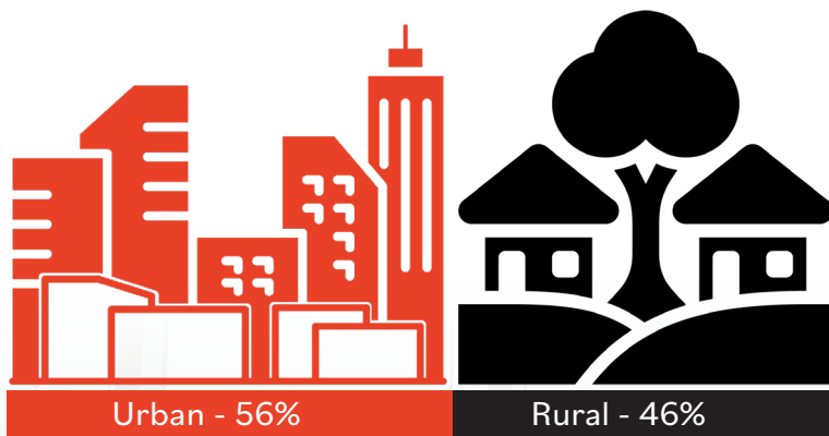
Population distribution (2024)